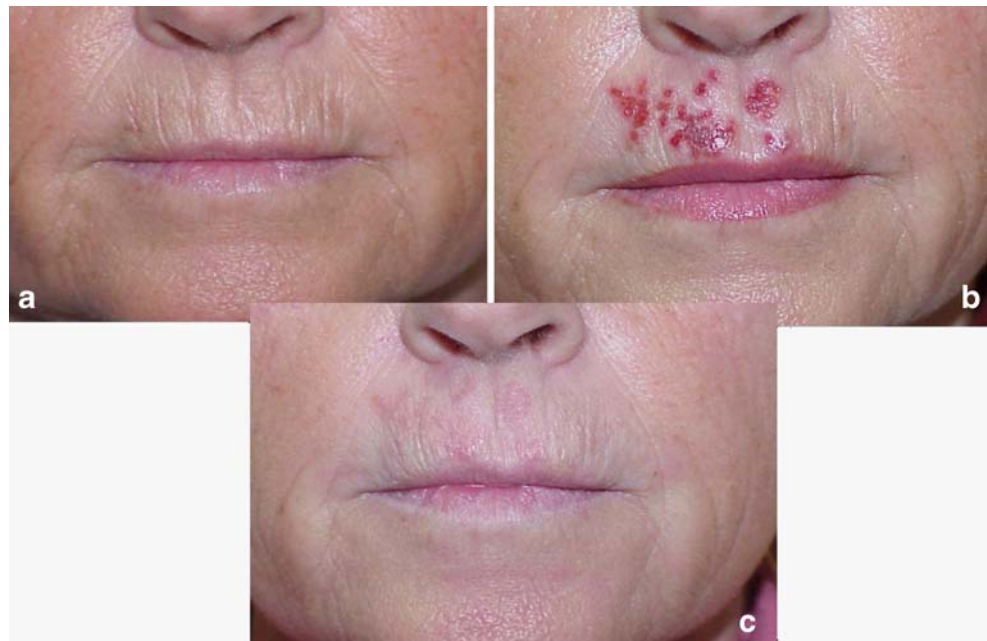
Fig. 4 Caucasian woman, 48 years old, skin phototype II, (a) before and (b) 1 week after fractional resurfacing of the upper lip. Tissue has healed after skin ablation, with clear improvement of the wrinkles; however, clear signs of herpes simplex infection are observed. c Aspect at 2 months after treatment. Herpetic lesion has healed without any scarring, but some lesion-related residual erythema is still present. Wrinkles are significantly better

Fractional resurfacing with Er:YAG laser with low incident doses and few passes for wrinkle treatment will obviously require more than one treatment session to enhance the condition of moderate to severely photo-aged skin. However, each subsequent treatment session at the same parameters will not go any further than the previous